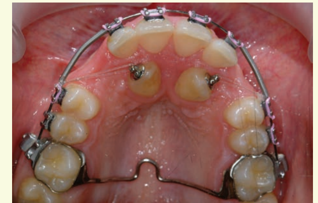
Canine teeth being moved into their correct positions